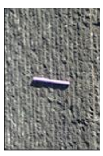
Figure 1: Finely milled substrate