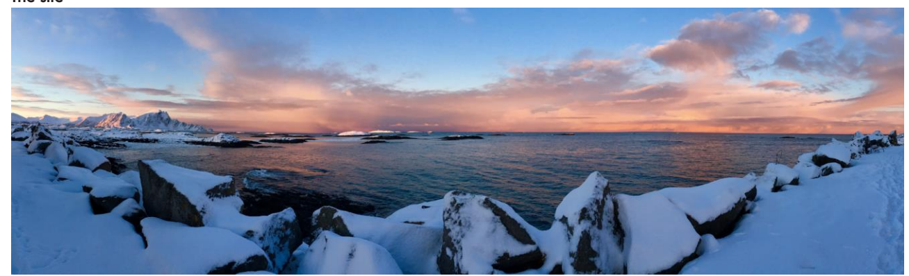
The view from the site